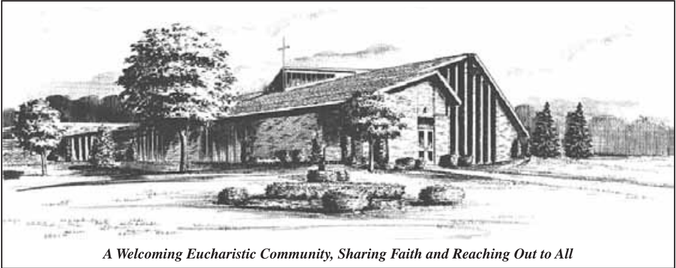
A Welcoming Eucharistic Community, Sharing Faith and Reaching Out to All

511 CHEAPSIDE ST., LONDON, ONTARIO N5Y 3X5 PHONE 519-433-6689 FAX 519-433-2301 E-MAIL: stmichlon@dol.ca www.stmichaels.dioceseoflondon.ca